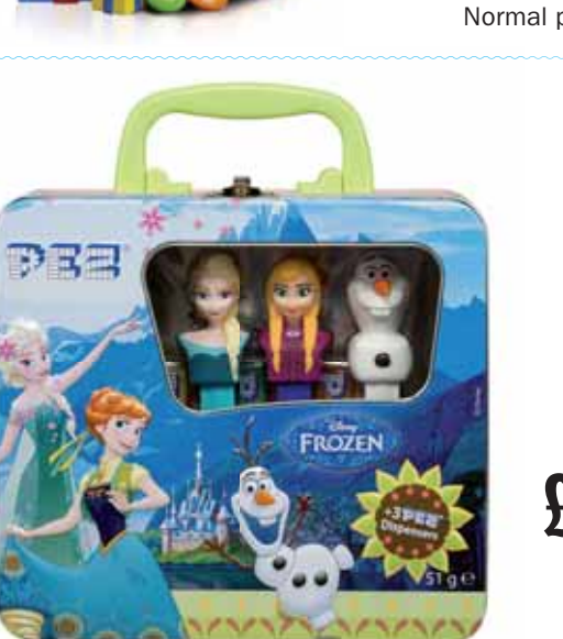
£9.90 Pez Frozen Tin 51g